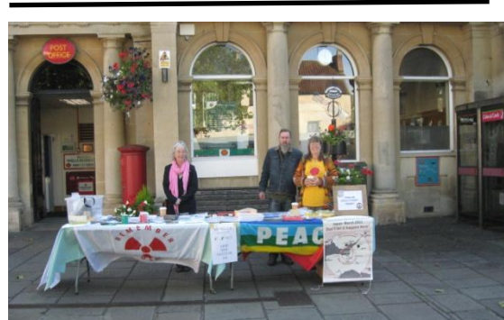
Mid-Somerset CND & Peace Group and Stop Hinkley Wells Market Saturday 22 nd September

The meeting will be held upstairs in the Kings Head in Wells on November 5 th at 7.30pm, all welcome.